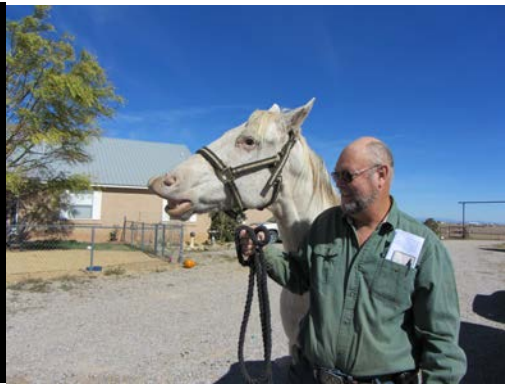
Hmmm... Whip didn't you like that!?